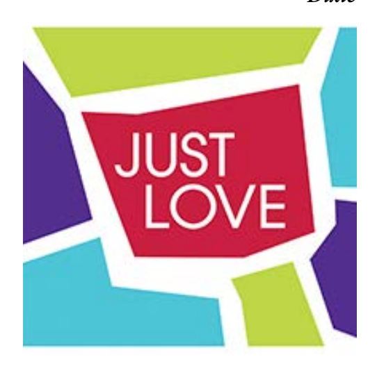
WOMEN OF THE ELCA GATHERING